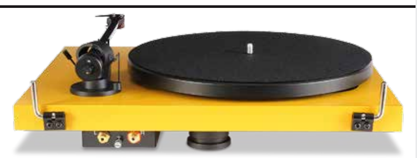
ABOVE: Stereo phono sockets are mounted beneath the far left of the plinth with Pro-Ject's 'Connect-it E' RCA cables supplied as part of the turntable package